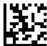
Data Matrix 55mils