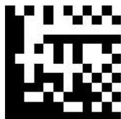
Data Matrix 100mils