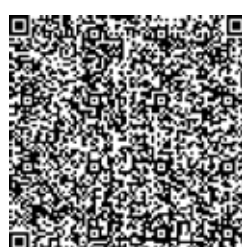
QR Code 15mils