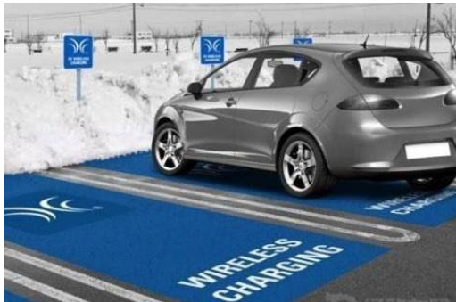
Honda displays wireless charging at the Consumer Electronics Show 2019

Wireless charging started more than a decade ago in the consumer market with products like electric toothbrushes. Today, consumers easily, successfully, and inexpensively wirelessly charge many things, including their cell phones, tablets, and smart watches. Moreover, the use of this technology is expanding into larger devices. Laptops are just starting to hit the market featuring wireless charging. Kitchen appliances are also being designed to take advantage of wireless charging. The ever-growing number of electric vehicles also look to wirelessly charge – imagine parking your car in a lot while you shop, or work and the battery is automatically charged!